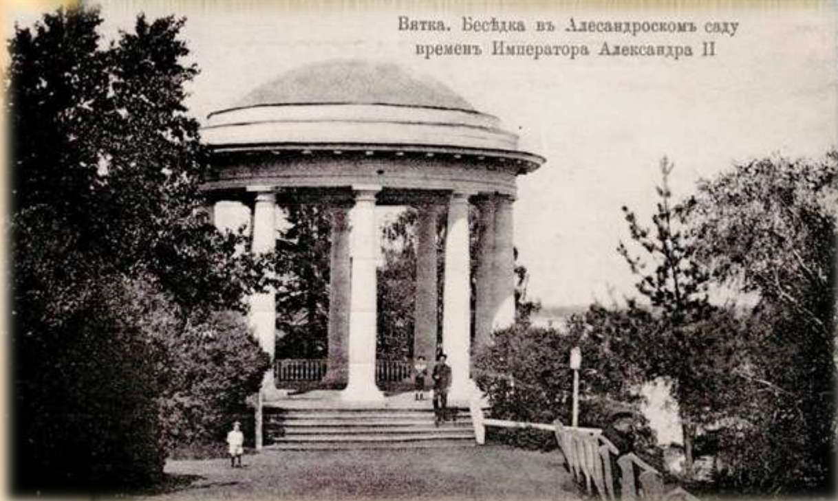
Вятка. Бесѣдка въ Александровскомъ саду время Императора Александра II