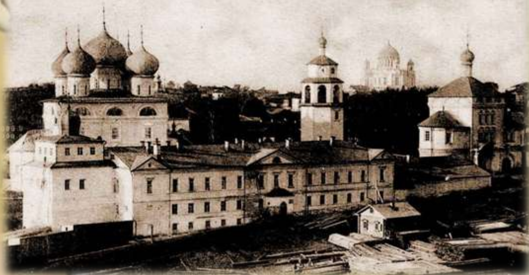
Вятский Успенский Трифонов монастырь